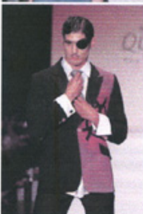
(top) Giddyup Fancy Pony Land. (Bottom): Argh. No, really, argh. Elmer Ave. swabs the catwalk.